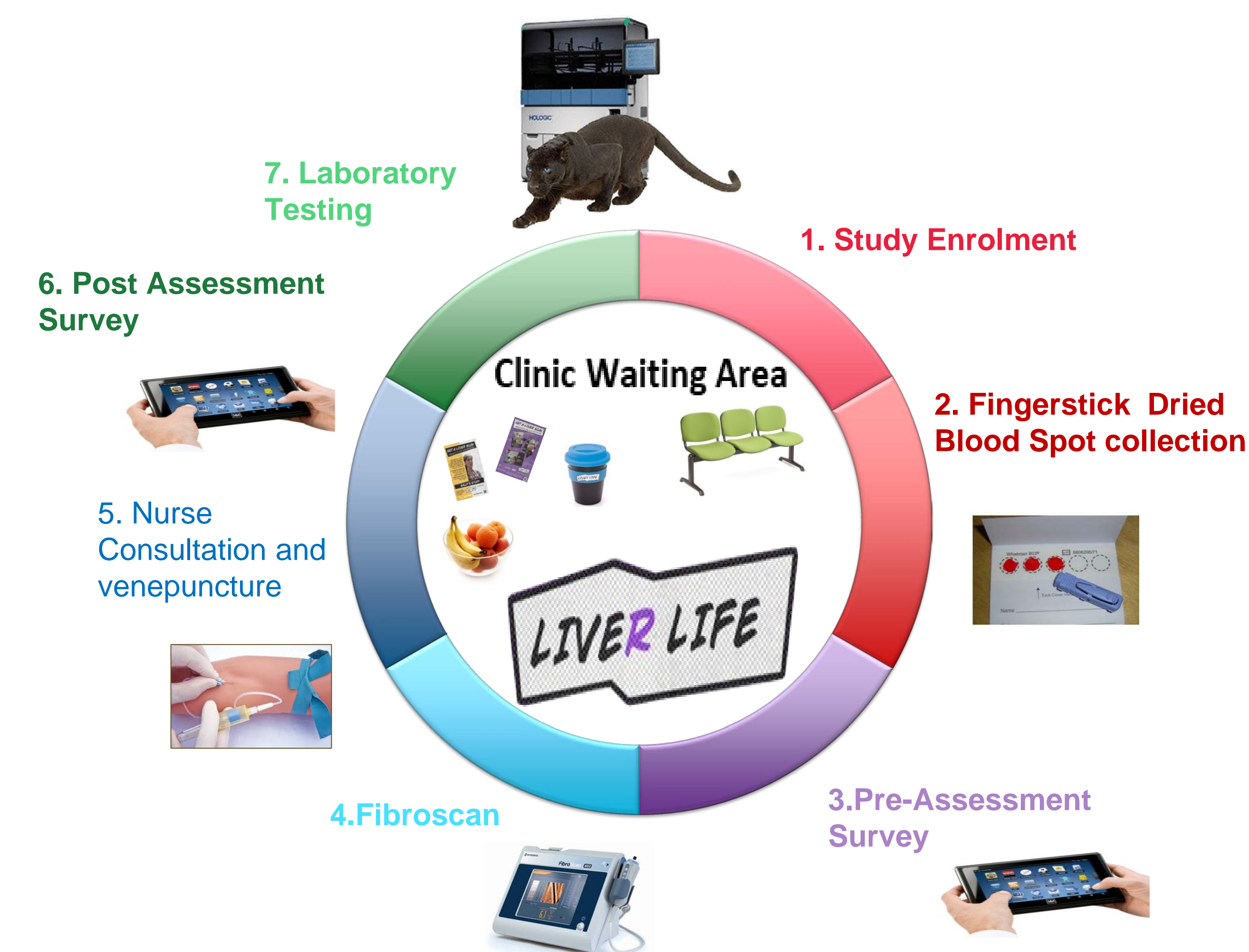
Figure 1. LiveRLife study assessments

The Aptima HCV Quant assay can detect active infection from DBS with acceptable diagnostic performance and is clinically comparable to plasma. This data will strengthen the case for the registration (with stringent regulatory authority approval) of a DBS kit insert claim, enabling future clinical utility.